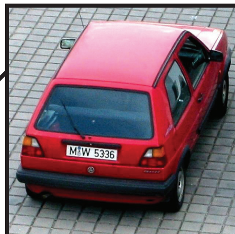
PTZ Close-up via CloseView