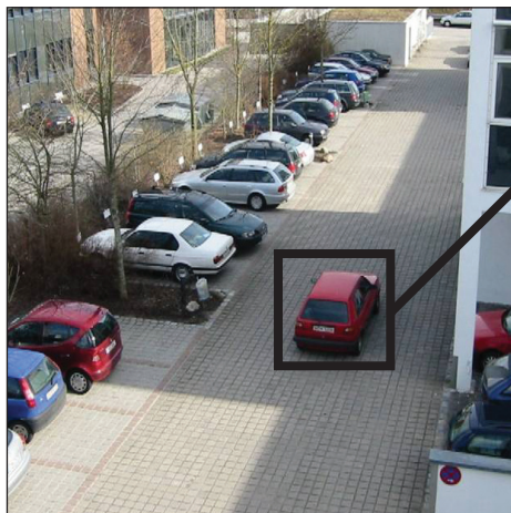
Diagnostic View from Fixed Reference Camera

CloseView is an intelligent auto-track PTZ controller and works in conjunction with up to four reference cameras for simultaneous multiple-object tracking. Supported NIO cameras includes high speed domes such as Interceptor™ or EyeMax® as well as many other industry standard domes.